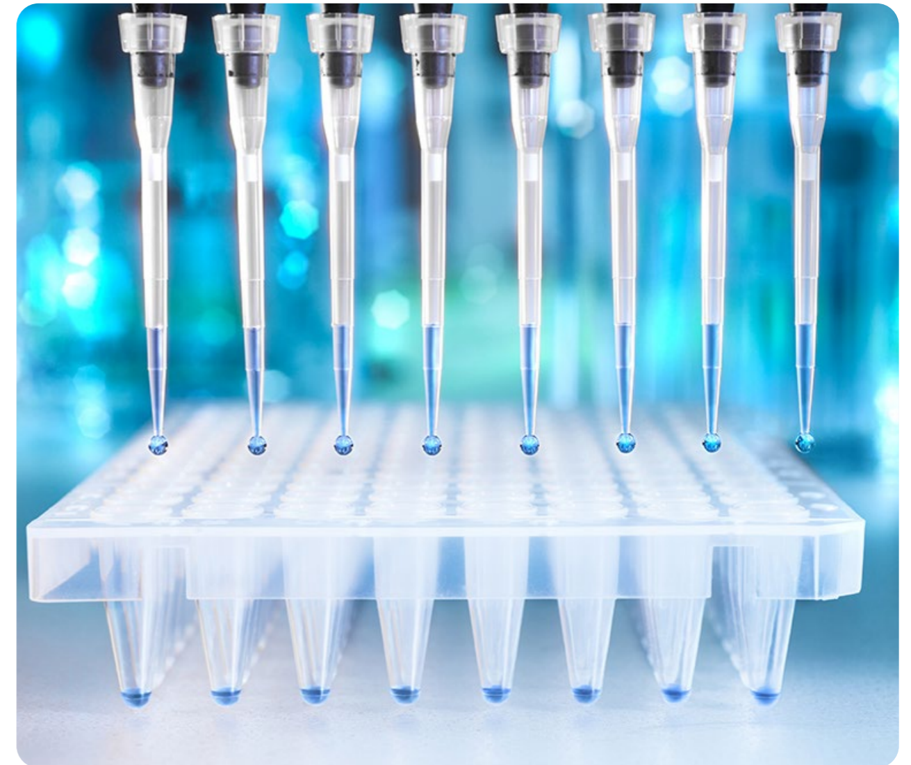
Labware and medical devices

The use of this product in any Medical Device must comply with the following criteria: Class I Medical Devices (European Union and/or U.S. FDA): the product may only be used for this purpose with prior notification to REPSOL MATERIALS, S.A. of each specific final application. Class II Medical Devices (European Union and/or U.S. FDA): the product may only be used for this purpose with REPSOL MATERIALS, S.A.'s prior written approval. This product may not be used for implantable devices and for Class III Medical Devices (European Union and/or U.S. FDA). REPSOL MATERIALS, S.A. makes no warranties, express or implied, which extend beyond the description contained herein. Nothing herein shall constitute any warranty of merchantability or fitness for a particular purpose. Before using a product sold by REPSOL MATERIALS, S.A. users should make their own independent determination that the product is safe, lawful and technically suitable for the intended use.